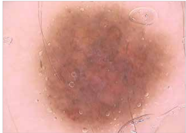
Figure 1. (Patient 1: first lesion) Negative pigment network and some blue-gray areas in favor of regression on erythematous background, some peripheral pigmented globules

The findings of eczematization resolve in time and need no therapy, but underlying lesion persists. Topical steroids and surgical excision are the choices for the therapy (4, 7).